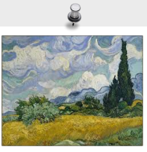
Wheat Field with Cypress